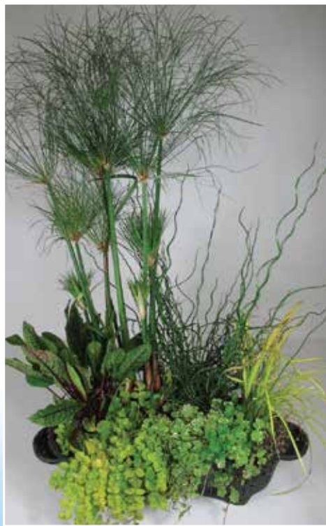
20" Cyperus Basket