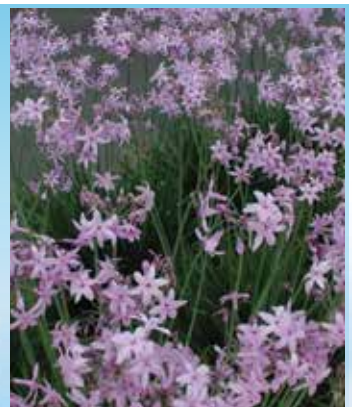
Tulbaghia violacea Green