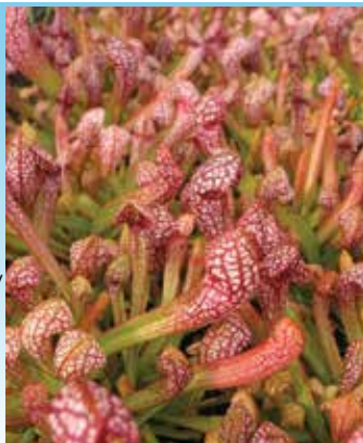
Sarracenia Scarlette Belle