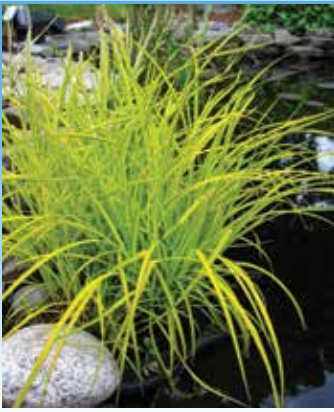
Carex riparia 'Bowles Golden'