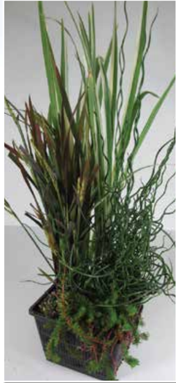
8" Hardy Basket