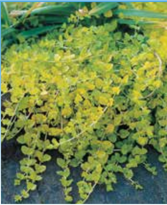
Lysimachia numm. Aurea