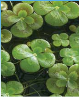
Marsilea mutica (clover)