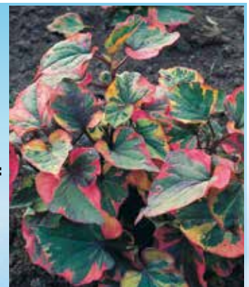
Houttuynia cordata variegata