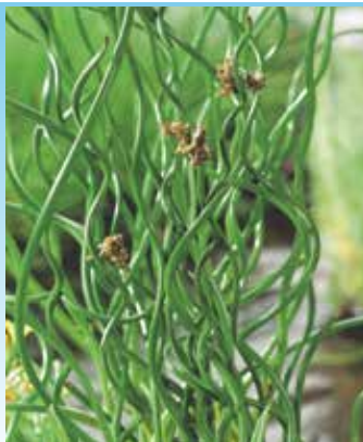
Juncus effusus spiralis