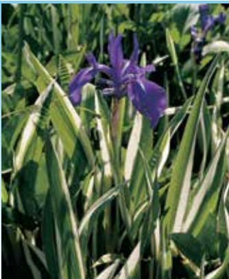
Iris ensata variegata