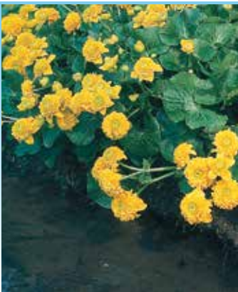
Caltha palustris multiplex