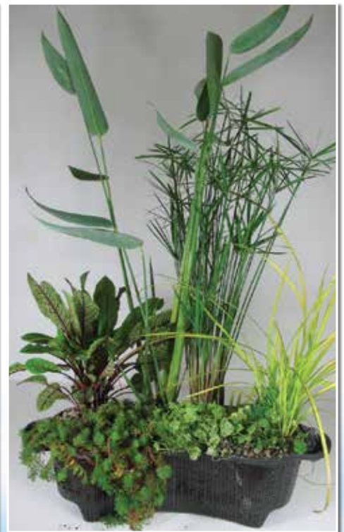
20" Thalia Basket