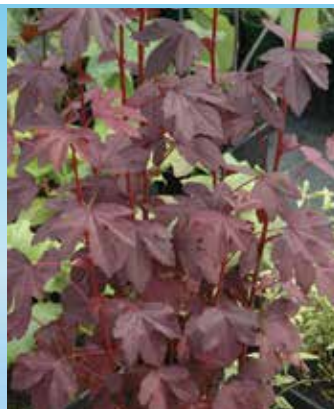
Hibiscus Burgundy Aquarius