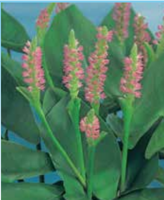
Pontederia cordata Pink