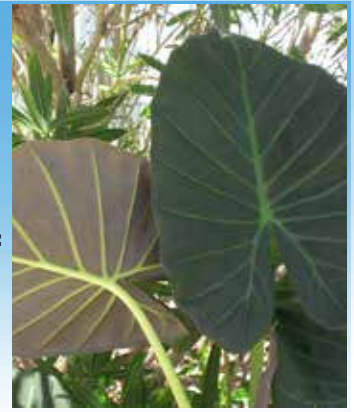
Alocasia Regal Shields