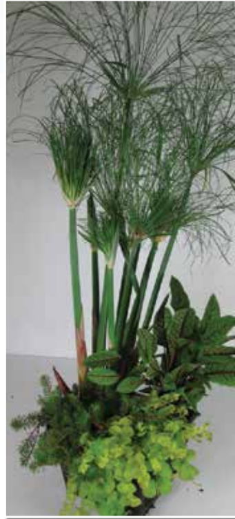
8" Cyperus Basket