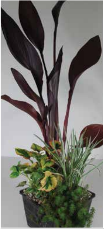
8" Canna Basket

These baskets could be used for ponds, but were intended to go with our hooks that fit in the patio bowls. Our floating islands are compatible only with the 8" baskets. The roots that will develop through the baskets will help keep your pond clean... naturally! Each 20" kidney basket contains a listed primary plant with 5 secondary plants. The 8" square basket contains a listed primary plant with 3 secondary plants. Please note: aqua baskets may not be exactly as pictured.