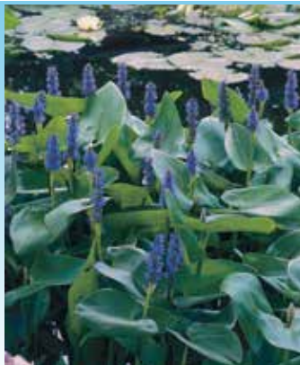
Pontederia dilata royal blue