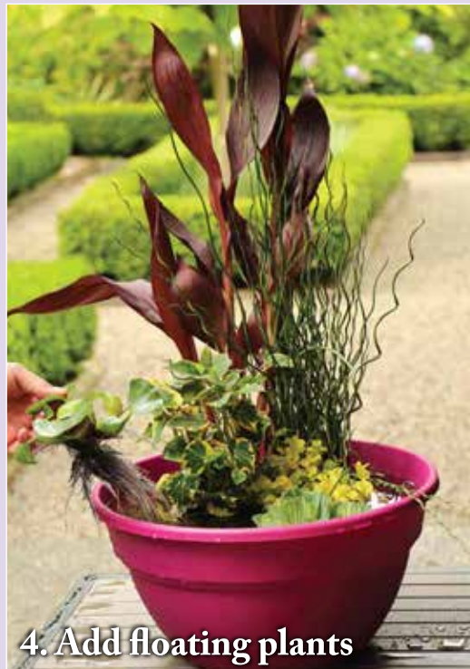
4. Add floating plants