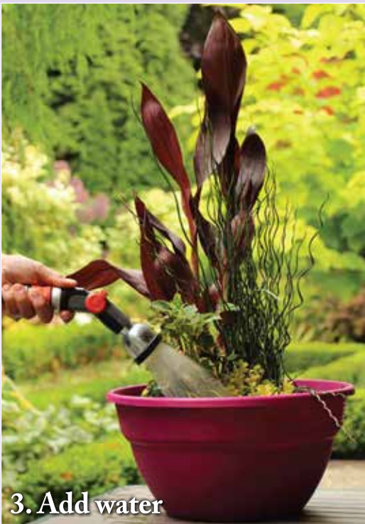
3. Add water