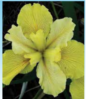
Iris Fortune Finder