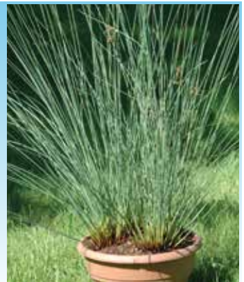
Juncus patens 'Carmen's Grey'