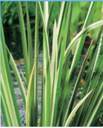
Acorus calamus Variegatus