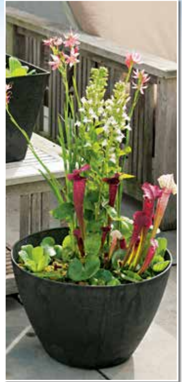
8" Sarracenia Basket