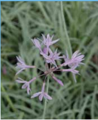
Tulbaghia violacea Variegata