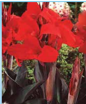
Canna Red King Humbert