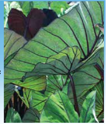
Colocasia 'Blue Hawaii'