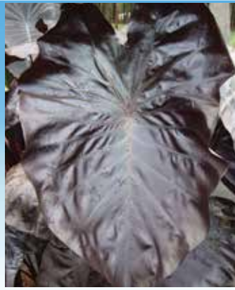
Colocasia 'Black Coral'