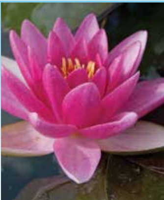
Nymphaea Charles de Meurville