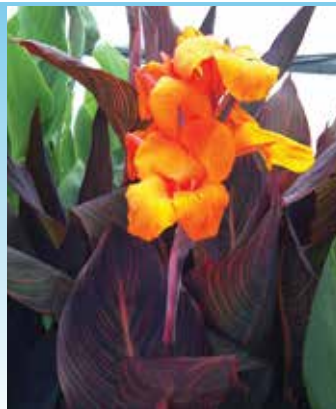
Canna African Sunset