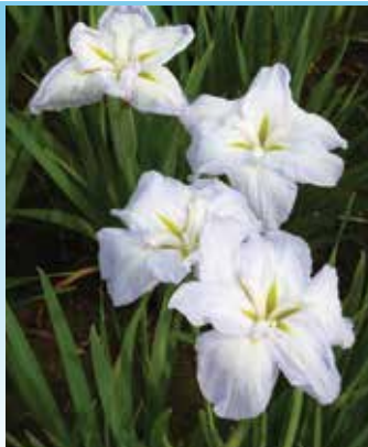
Iris ensata White