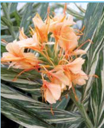
Hedychium Vanilla Ice