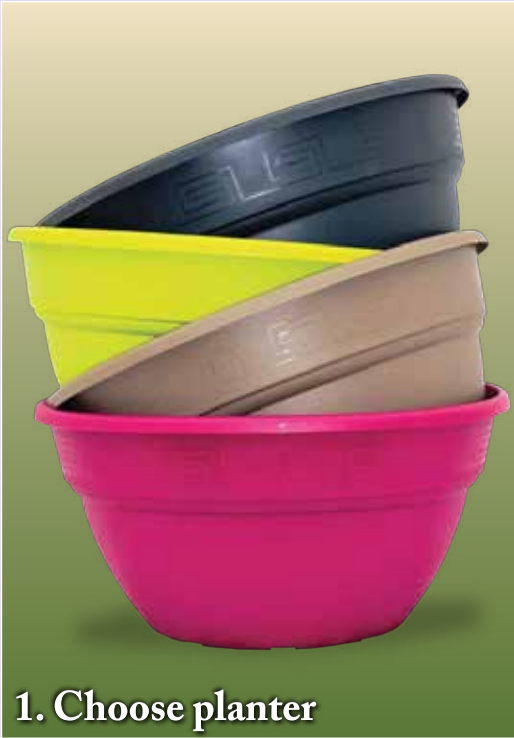
1. Choose planter