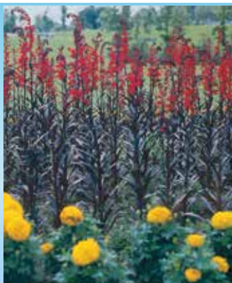
Lobelia c. 'Queen Victoria'