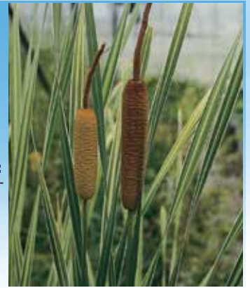
Typha latifolia variagata