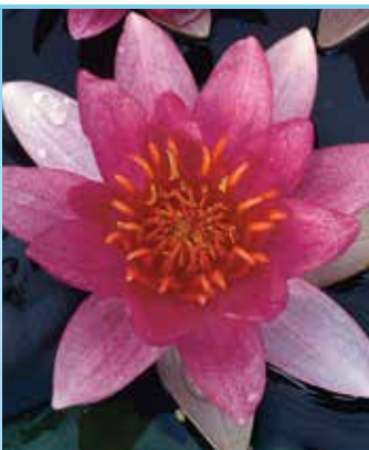
Nymphaea Pygmea Red