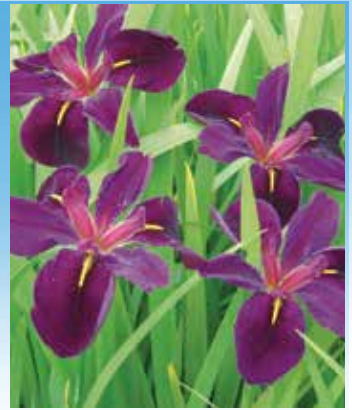
Iris Black Gamecock