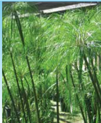
Cyperus 'Giant Papyrus'