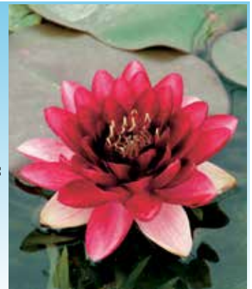
Nymphaea Perry's Almost Black