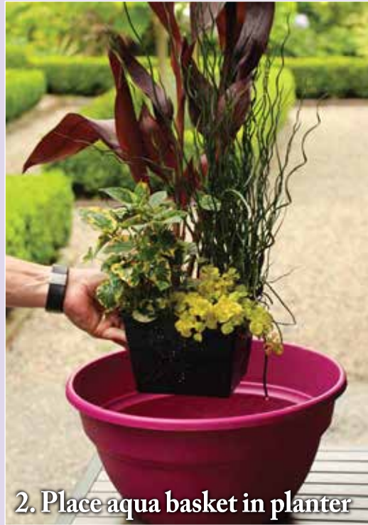
2. Place aqua basket in planter