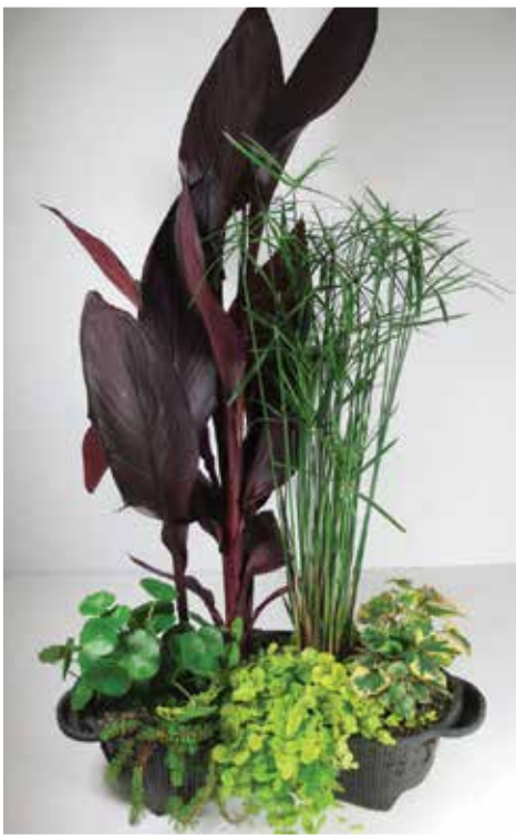
20" Canna Basket